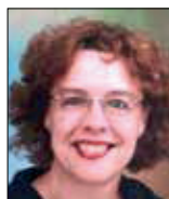
Author Alexandra Helena Jacoba Janssen

This case series aimed to describe treatment effects and experiences of patients who switched from negative pressure wound therapy (NPWT) to a rapid capillary action dressing (RCAD; VACUTEX™). Ten consecutive patients who prematurely terminated NPWT were recruited. Mean time to complete wound closure was 87.3 days (SD 38.3). The main reasons for terminating NPWT were maceration of the skin caused by the film and patient discomfort. All patients preferred the RCAD, mainly because of better mobility and no noise, compared to the NPWT device. A RCAD appears to be a promising treatment modality.